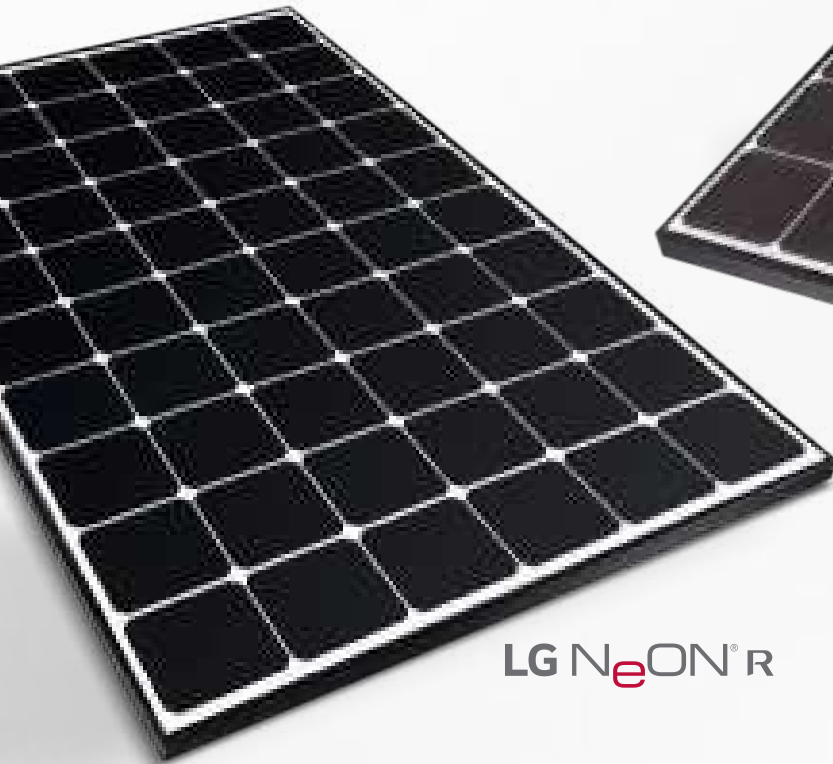
LG NeON ® R