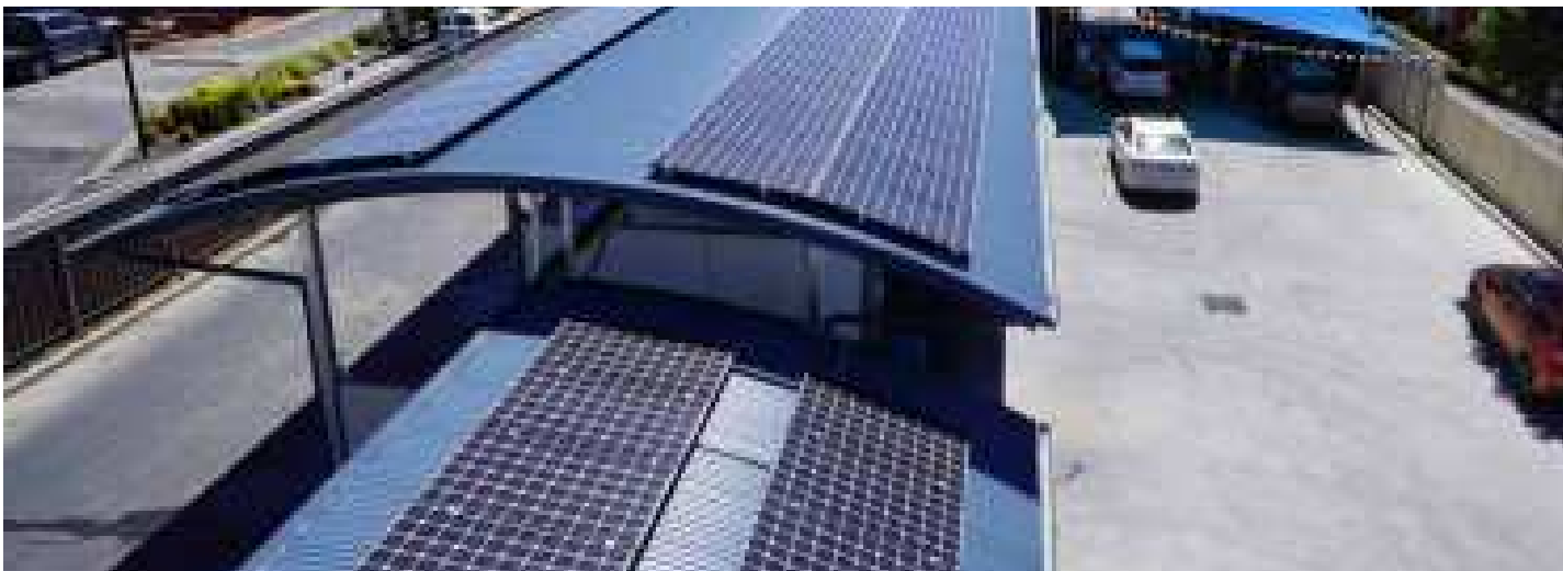
40 kW LG NeON system, carwash, Bathurst

Subject to the terms in this document, for modules manufactured from October 2017 onwards, being the A5 and V5 model range, LG will for a period of twenty five (25) years from date of original install authorise a free of charge repair or replacement (at LG's discretion) of the module, if in LG's opinion, it needs repair or replacement because of a manufacturing or materials defect appearing within, and notified to LG in accordance with this warranty. This warranty is only applicable to modules under normal applications, installations, use and service conditions.