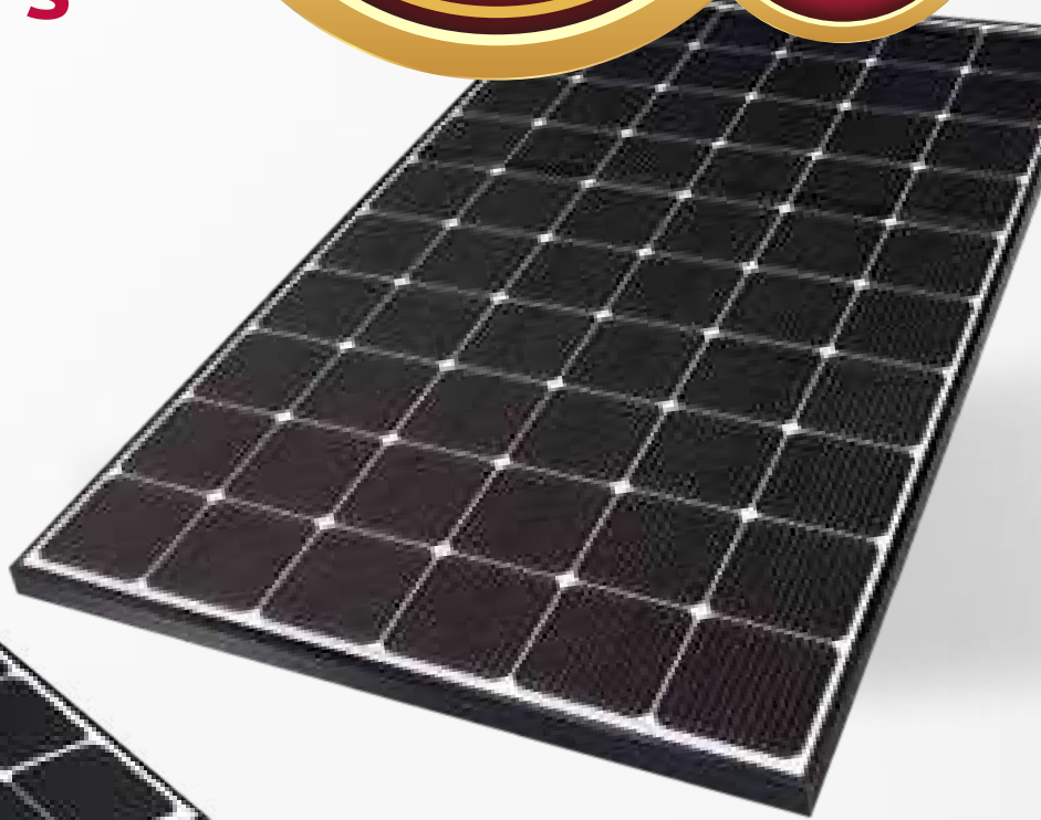
LG NeON ® 2